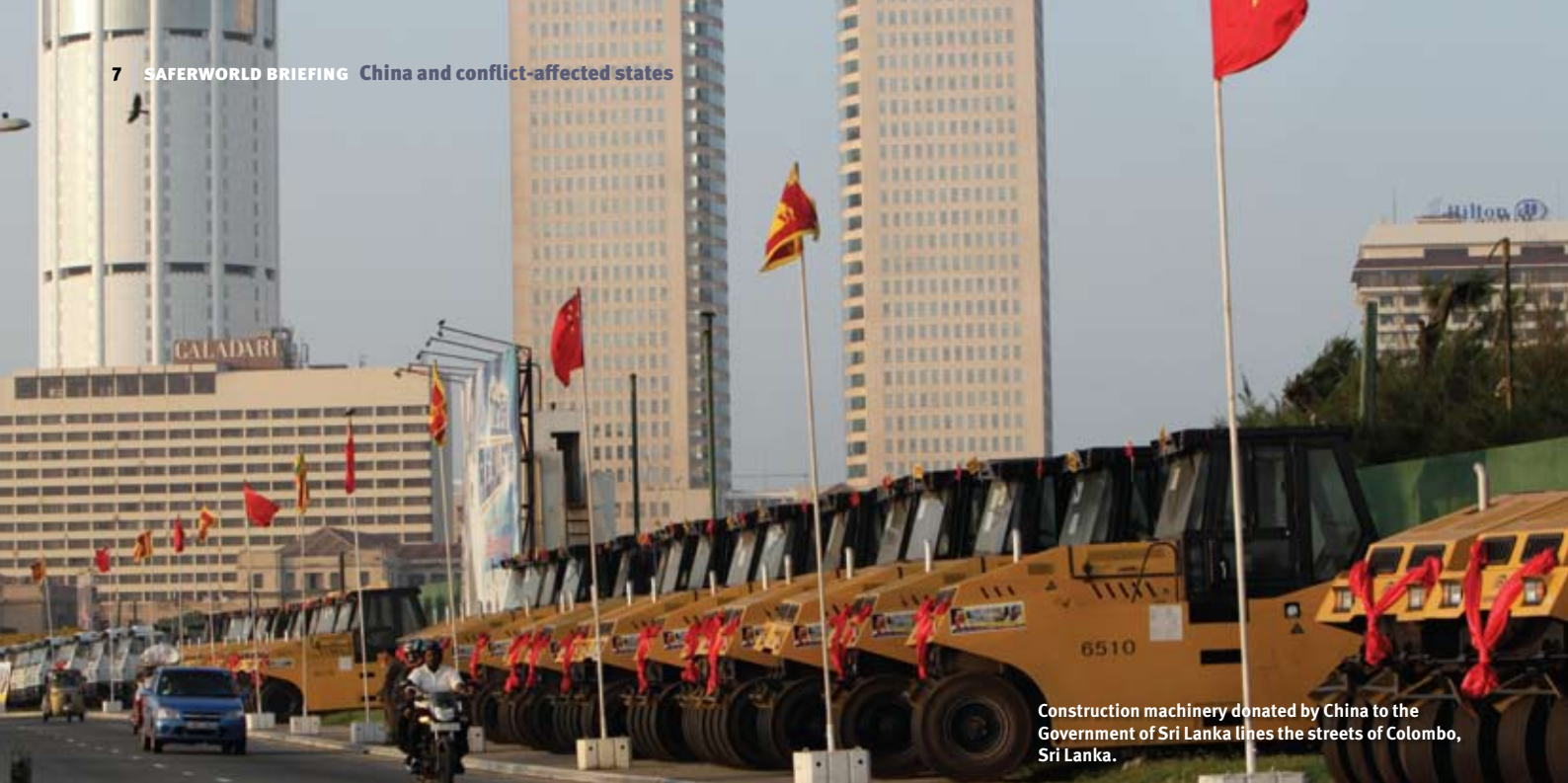
Construction machinery donated by China to the Government of Sri Lanka lines the streets of Colombo, Sri Lanka.