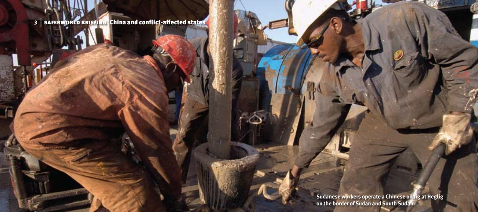
Sudanese workers operate a Chinese oil rig at Heglig on the border of Sudan and South Sudan.